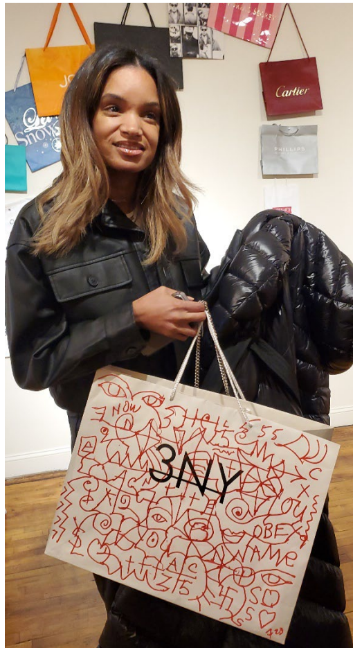
Above: People drawing on the shopping bags